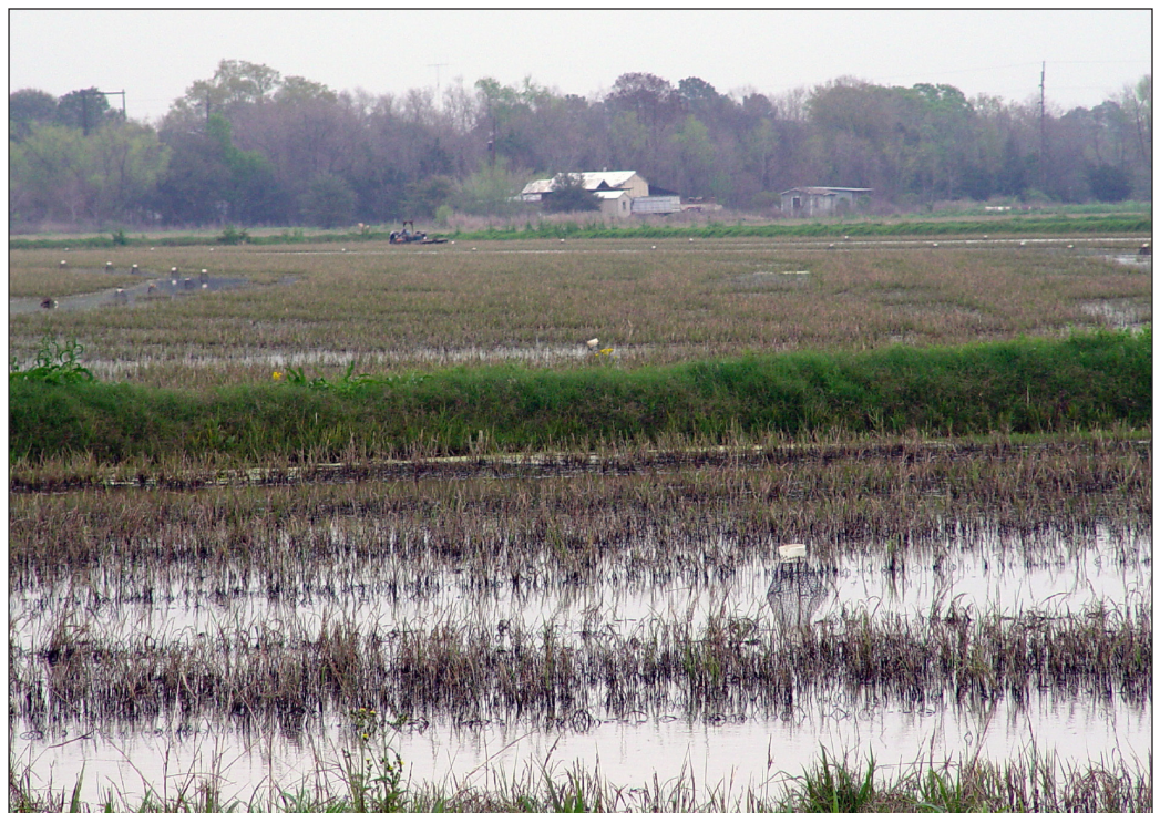
Figure 3. Typical rice field/crawfish pond found in south central Louisiana. Notice the large leveled fields with little to no slope and low, minimum levees. For reference of water depth, crawfish traps are approximately 22 inches tall.

Crawfish aquaculture uses more water than most other agricultural crops and discharges greater volumes of effluent. The environmental impact of this effluent on receiv-