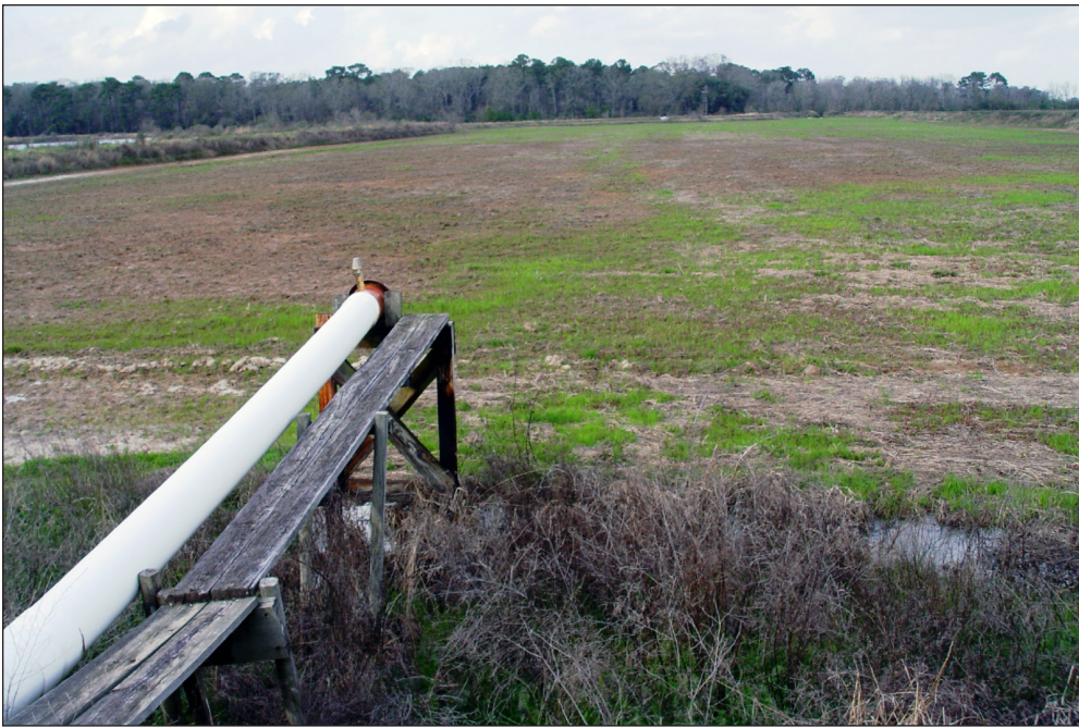
Figure 1. One of several abandoned catfish ponds on this farm that have been laser leveled and readied for conversion to a crawfish pond.

used to shape the pond bottom as desired, moving large volumes of soil may not be recommended. Removing top soil from large hills during severe leveling operations will sometimes limit forage establishment in those areas, and deep fills within the pond floor will often cause soft spots that could hinder subsequent equipment traffic. Locations that require minimal leveling are preferred.